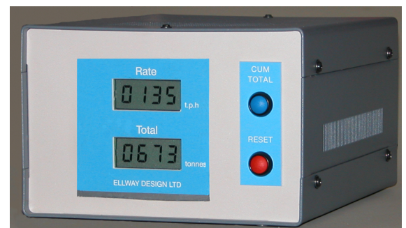
Desk top unit