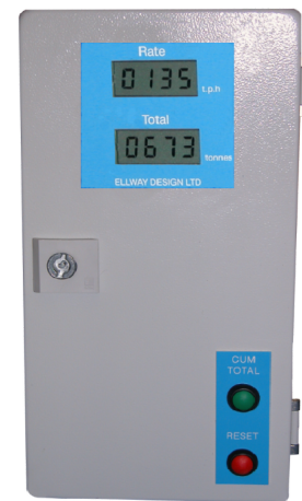
Wall mount unit